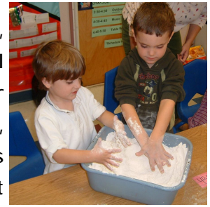
Play as well as a structured learning environment offer a variety of learning opportunities to suit different learning styles!

Please call to discuss your child's educational needs or to learn more about the services offered in your area.