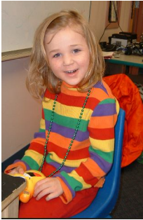
Learning should be fun. We make certain it is!